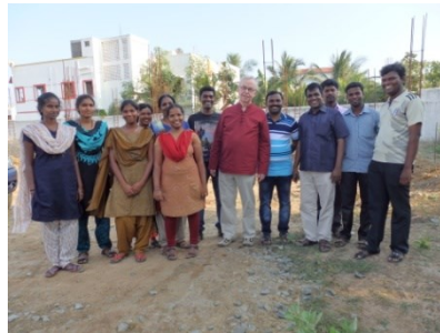
We Group Core Committee Members

We were in heavenly joy when our dear Pappa visited us in the month of February. He stayed one day in St. John's Home along with us and attended our primary school annual day function and expressed his happiness with little blossoms in the school and in the boarding.