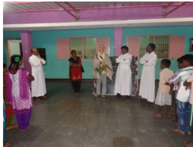
St John's Campus, Neerpair