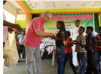
RC Primary School, Neerpair