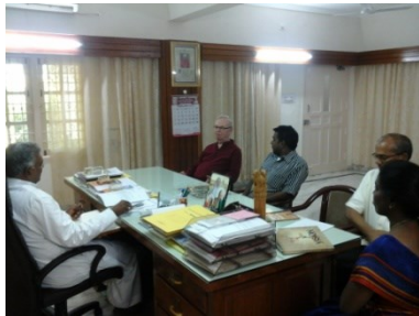
Meeting with Bishop