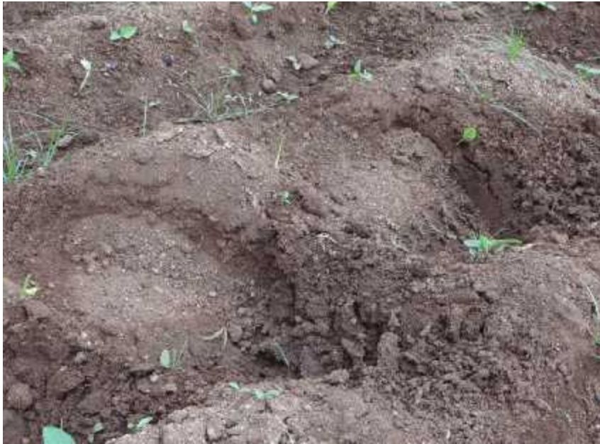
Problems from Wild Animals.