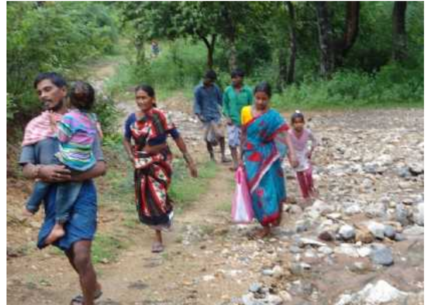
No Road to travel